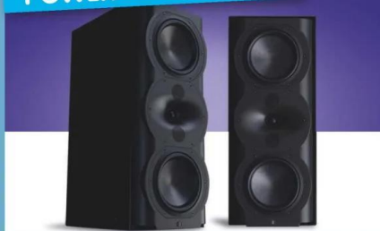
Perlisten's stunning R5m three-way standmount