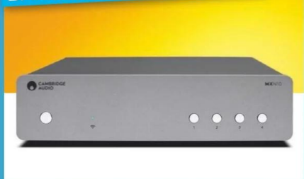
Cambridge Audio's MXN10 plug-and-play streamer