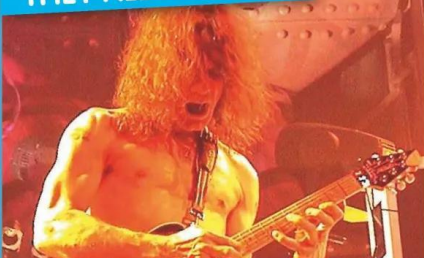
Flashback: Eddie Van Halen goes to war with his band